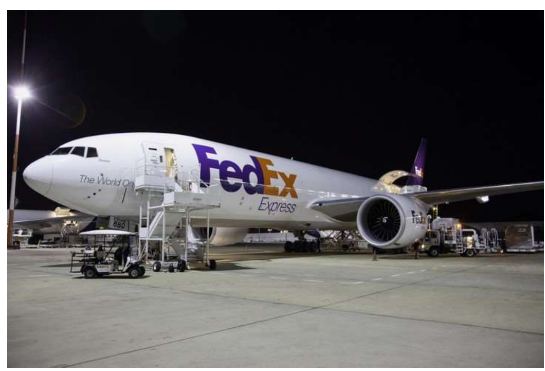
U.S.-Cuba Trade and Economic Council, Inc.

\underline{https://www.cubatrade.org/blog/2018/12/15/failure-of-agreement-between-fedex-amp-cuba-is-a-problematic-and-oft-repeated-symbol}