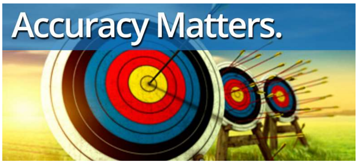
U.S.-Cuba Trade and Economic Council, Inc.

account; and the current owner of Stonegate Bank, Arkansas-based Home BancShares, has refused to discuss why it will not pursue a direct correspondent banking agreement. The government of the Republic of Cuba has thus far refused to authorize United States companies to directly export products to the registered self-employed in the Republic of Cuba; the Obama Administration authorized such transactions. The government of the Republic of Cuba has thus far refused access the Republic of Cuba marketplace by United States-based consumer retail and consumer service providers; there are many United States companies (including law firms, consultancies, accounting firms) who sought, but were refused authorization to establish offices in the Republic of Cuba.