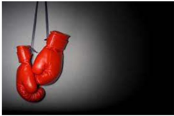
U.S.-Cuba Trade and Economic Council, Inc.