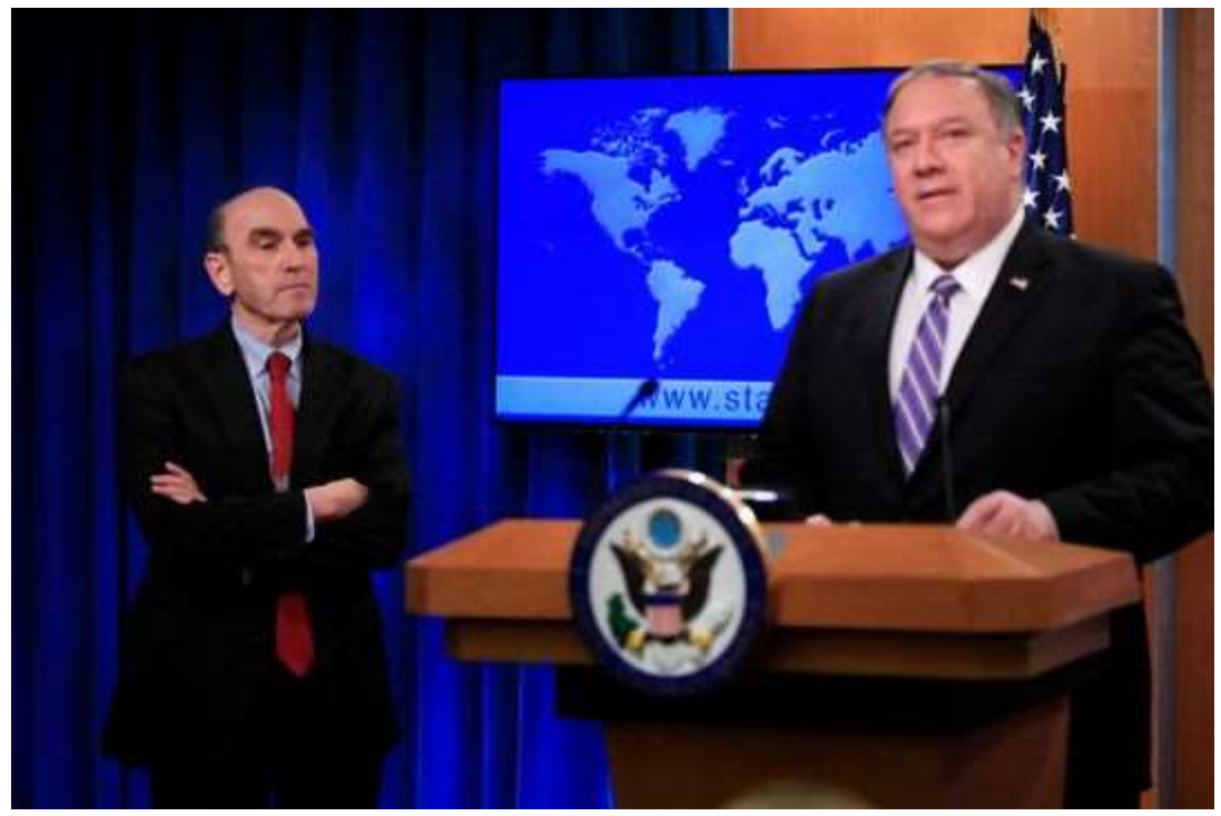
U.S.-Cuba Trade and Economic Council, Inc.