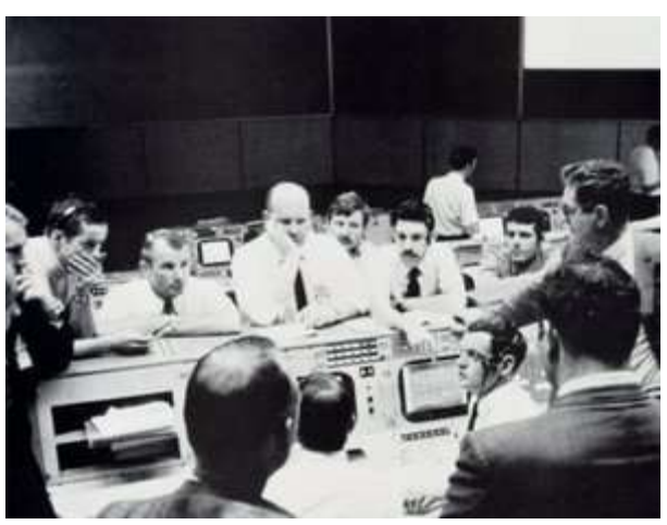
U.S.-Cuba Trade and Economic Council, Inc.