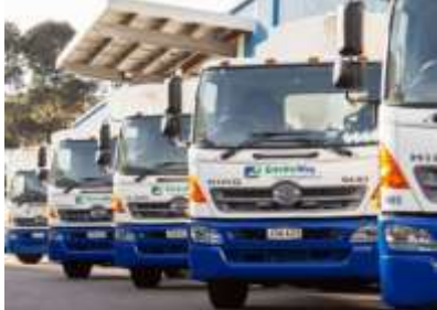
U.S.-Cuba Trade and Economic Council, Inc.