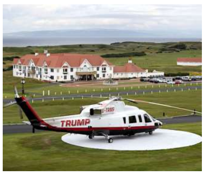
U.S.-Cuba Trade and Economic Council, Inc.

When New York, New York-based The Trump Organization transfers funds to the United States from one of the five countries which host four of its hotels and seven of its golf clubs, The Trump Organization does not use a third country; it uses a straight line- a financial institution electronically transfers the funds from Canada, Dubai, Indonesia, Ireland or the United Kingdom to New York City. The Trump Organization does not want to waste time or waste money. The Trump Organization uses financial institutions with direct correspondent banking accounts.