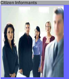
Using large populations of Citizen Informants, governments have been able to track, monitor, harass, entire populations.

Systems of control and conformity have been used in East Germany, Russia, etc. These systems are now emerging in democratic countries.