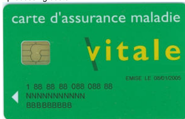
Smart card used for health insurance in France.

This however, is not the only purpose that a read-write microchip implant could serve. It could also facilitate and record financial transactions. Many credit card companies are already working to develop Smart Card technology , using chip-based payment products which are projected to reduce both fraud and transaction processing costs. [56]